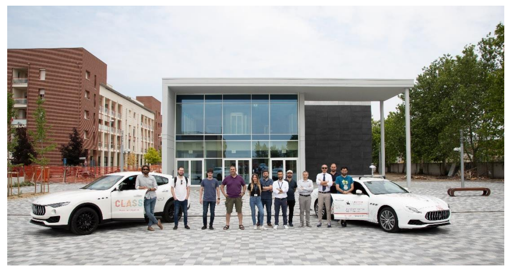
The CLASS consortium in Modena

Current trends towards the use of big data technologies in the context of smart cities suggest the need of novel software ecosystems upon which advanced mobility functionalities can be developed. "Can you imagine a city where data is shared between the city and cars to allow for smart traffic management and advanced driver assistance systems? This is the contribution of CLASS project that facilitates development of complex big-data analytics capable of enhancing the interaction between vehicles and citizens in urban areas in real-time", says <a href="Eduardo Quiñones">Eduardo Quiñones</a>, CLASS coordinator and senior researcher at the <a href="Barcelona Supercomputing Center">Barcelona Supercomputing Center</a> (BSC).