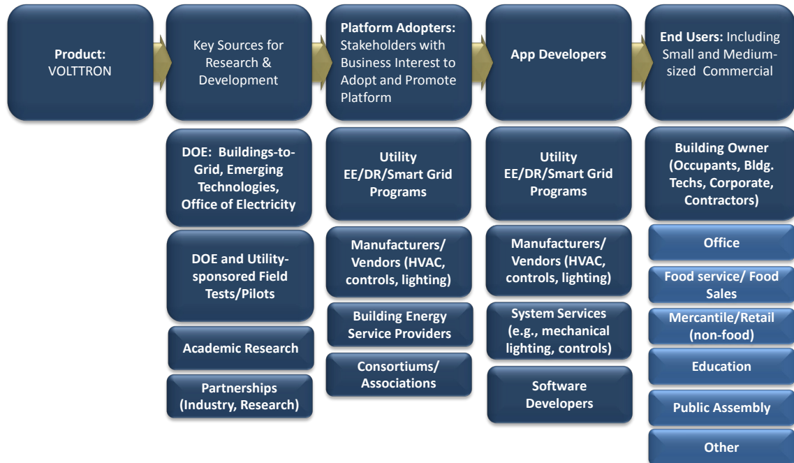
Figure 3.1. Platform Ecosystem and Market Landscape for VOLTTRON (as related to SMCB)

Figure 3.1 provides a summary list of the key stakeholders, customers, and sources of R&D for energy services in the SMCB market, described in terms of a platform environment or ecosystem.